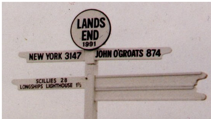
"So, next year, New York eh lads?"

We will be enduring a full leg wax for the cause (now that has got to be worth a few quid!)